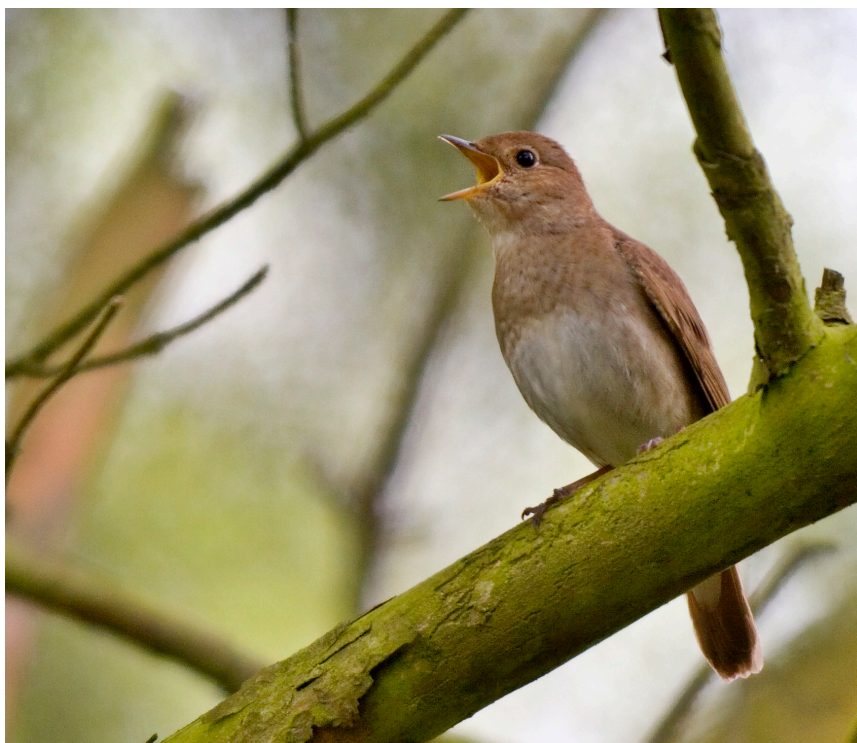
Most Thrush Nightingales arrive in May.

We have compiled a table to answer questions like these – as a tool to help understand the situation when it comes to bird occurrence in Skåne and also to satisfy birdwatchers of an inquiring mind.